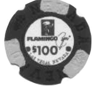
Black with beige inserts

Fabulous Fakes! Yes, I learned about, and purchased some Flamingo Capri Borland imitations – really counterfeit chips. Bill Borland purchased the rights to the NEVADA and DIECAR molds, and the hotstamp dies used by a number of casinos, including the Flamingo Capri. He produced some pretty decent hot stamp imitations of several chips. Not all subsequent sales of these Borland chips alluded to their "remanufactured" status.